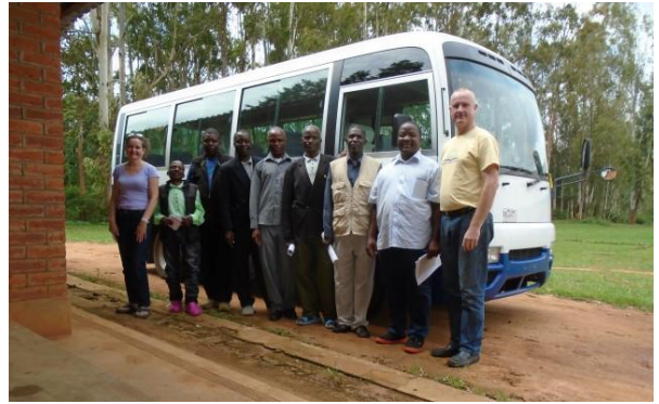
College staff and the newly-acquired coach

As we look to this new year we should remember that tomorrow is not guaranteed for any of us. As Christians, we have the hope of eternal life burning in our hearts; but there is a work, the Lord's work, to do here and now. This is the time. This is the place. This is the moment. We continue to urgently need your support, particularly regular monthly contributions. Funding the Lord's work is so important; when we are out preaching, you are preaching with us; when we are teaching, you are teaching with us. The lost are reached with the gospel and the Lord's church strengthened because we all working in fellowship together – each supplying what the other lacks. There are also other ways to contribute: why not visit us? Are you a tailor or seamstress and willing to pass on your skills? A carpenter/joiner wanting to help others learn a trade? We have a growing vocational training programme ; we need your help. Beekeeping, sub-Saharan farming, first aid, vehicle mechanics, welding and fabrication. There's a place and job for anyone who has the skills and desire to be involved. Contact us for more details.